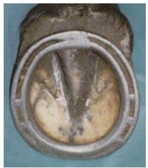
Top. A very upright hoof, known as a 'club foot', is a common deformity which will require special consideration.

Bottom. Some veterinary conditions improve with therapeutic shoeing. Horses suffering from navicular disease can benefit from an eggbar shoe being fitted to the affected hoof.