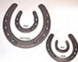
'Different sizes of shoe'

Horse's feet grow continually, like a fingernail, and are worn away over time. Horses only need shoes if their hooves wear down too much because of the work they are doing, such as riding out on roads. Horses may also need special shoes if they have a foot problem as they can help the foot to recover.