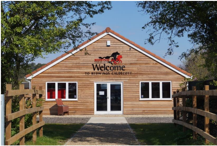
The Welcome Centre