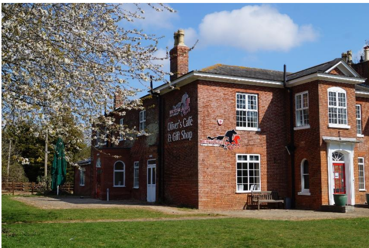
Caldecott Hall housing the Sydney Suite, gift shop and café.